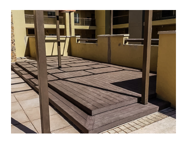
Alexir Group are experts in composite products and the installation thereof,