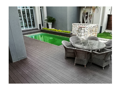
All of our products offer high durability, reliability and affordability as well as a 10, 15 and 25 year factory guarantees.